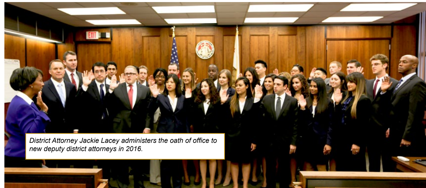
District Attorney Jackie Lacey administers the oath of office to new deputy district attorneys in 2016.

Fifty-five percent of the new hires brought in under District Attorney Lacey were women, roughly 24 percent were Asian-American, 12.5 percent were Hispanic/Latino and 9 percent were African-American.